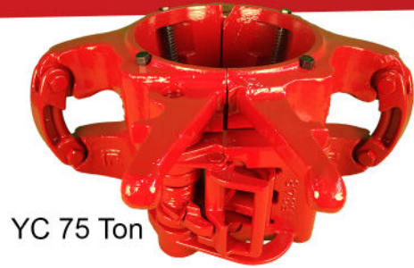
YC 75 Ton