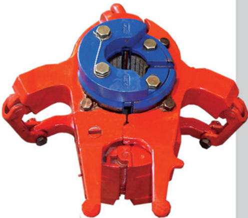
MYT 40 Ton