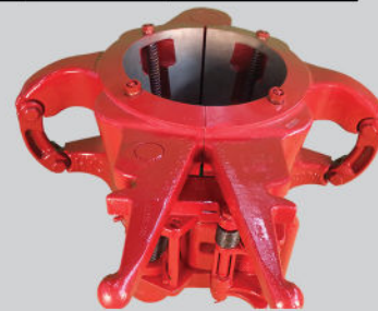
HYC 200 Ton