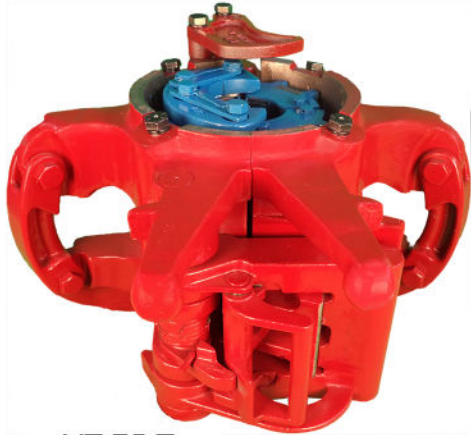
YT 75 Ton

The "Y" series elevator is a slip type manual elevator for tubing (MYT, YT) and casing (YC, MYC, HYC). The elevators hoist a variety of small casing and tubing with the proper size slips and setting ring installed. The load causes the slips to set when the elevator is raised, pushing down on the slip setting ring. Elevators are equipped with a latch and latch lock combination.