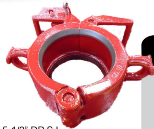
5-1/2" DP SJ

The elevator has a simple, reliable latch which locks simultaneously when elevator is closed. At TIOT, we can accommodate the SJ to handle drill pipe.