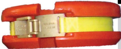
9-5/8" Thread Protector